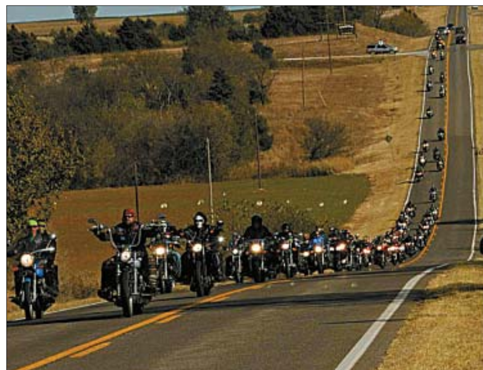
Shots like the one above are far too often the result of a sad occasion such as the funeral procession of a fellow biker. It's good then, when the event is one of fun and fellowship such as this photo from the ABATE Fall Gathering. Here's to many more good times for ABATE of Oklahoma and motorcyclists all around the state in 2011.