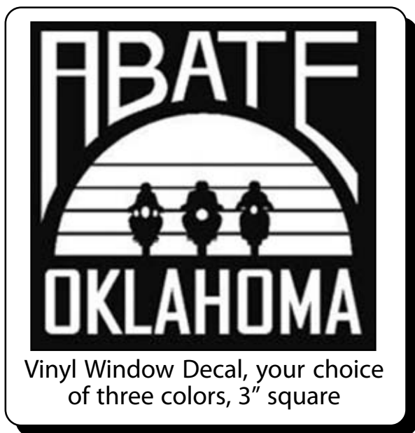
Vinyl Window Decal, your choice of three colors, 3" square