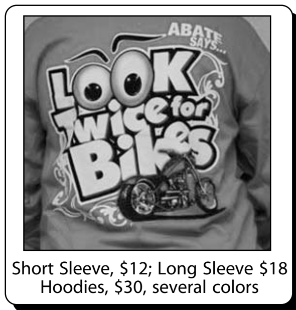
Short Sleeve, $12; Long Sleeve $18 Hoodies, $30, several colors