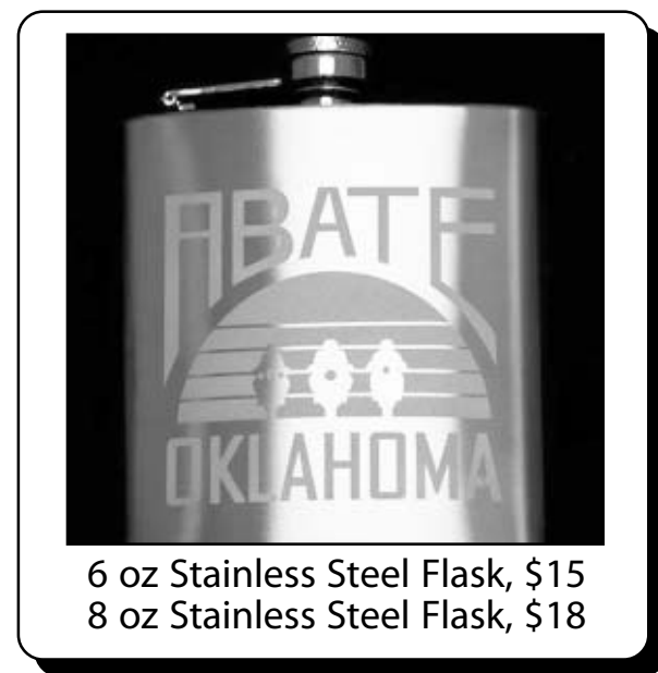
6 oz Stainless Steel Flask, $15 8 oz Stainless Steel Flask, $18